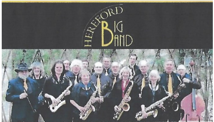
Hereford Big Band, a full size swing Band of 22 musicians will be in concert playing a wide repertoire from the 20's 30's, 40's and beyond