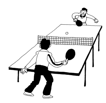
Table Tennis at Little Birch Village Hall

Following on from the first two very successful table tennis sessions at Little Birch Village Hall, we have decided to buy a brand new table making it three tables in all so that everyone can have plenty of table time. These sessions have proven to be extremely sociable events with everyone having great fun and everyone will be made welcome. Those who have attended previously, please note the change of start time from 7:30pm to 7:00pm.