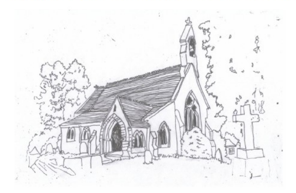
Donations to cover costs and for much needed renovation work at St Mary's Church. Thank you

Enjoy a break for a cup of tea or coffee