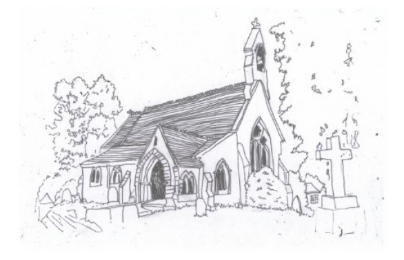
Donations to cover costs and for much needed renovation work at St Mary's Church. Thank you

Enjoy a break for a cup of tea or coffee